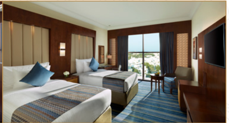
SUPERIOR TWIN ROOM

Our standard 26 square-meter Superior King rooms feature a modern yet relaxing atmosphere with a spacious work area.