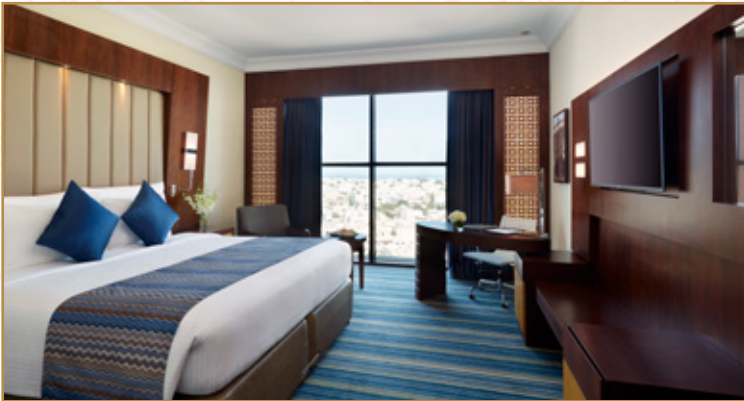
SUPERIOR KING ROOM

Our standard 26 square-meter Superior King rooms feature a modern yet relaxing atmosphere with a spacious work area.